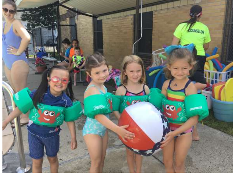
Sterling House Summer Camp had an epic 8 weeks of camp wide activities, Erin's Gym, Pool, playground, snack shack, and so much more! Our newly refurbished pool was filled with 300 joyful swimmers.