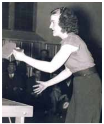
TABLE TENNIS EVENT PLANNED IN STRATFORD

It was decided at a meeting of the Sterling House Table Tennis club yesterday to have another "round table" division in the annual Stratford Open championship tournament scheduled for Sunday, April 10, at the Stratford American Legion hall. This competition, which proved highly popular last year, will take place before the semi-final round matches in other divisions. (April 1949)