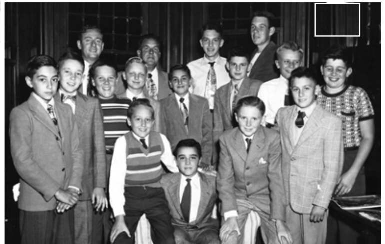
At right, 1949 Little League Champions